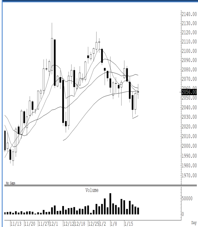
GOH24 (Close 2,056.0 Chg 1.30)

ราคาทองคำโลกปรับตัวลงมาที่แนวรับสำคัญ (2,030) เราแนะนำยกการ์ดสูงหรือตั้ง stop ไว้ จากราคาที่แกว่งแรง แนวโน้มยังอยู่ข้างล่างจนกว่าจะกลับขึ้นไป ปิดเหนือระดับ 2,060 ดอลลาร์เป็นอย่างน้อย แนะนำ trading ในกรอบ 2,040-2,065 ดอลลาร์ รับรู้กำไร แต่ถ้าในกรณีที่ปิดต่ำกว่าระดับ 2,020 ดอลลาร์ แนะนำ ถือ short หวังผลปรับตัวลงไปแถว ๆ 1,980 ดอลลาร์ รับรู้กำไร